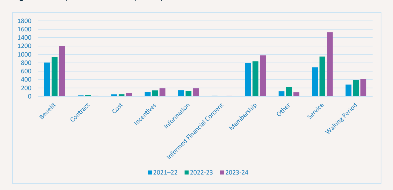
Figure 2: Complaint issues over past 3 years