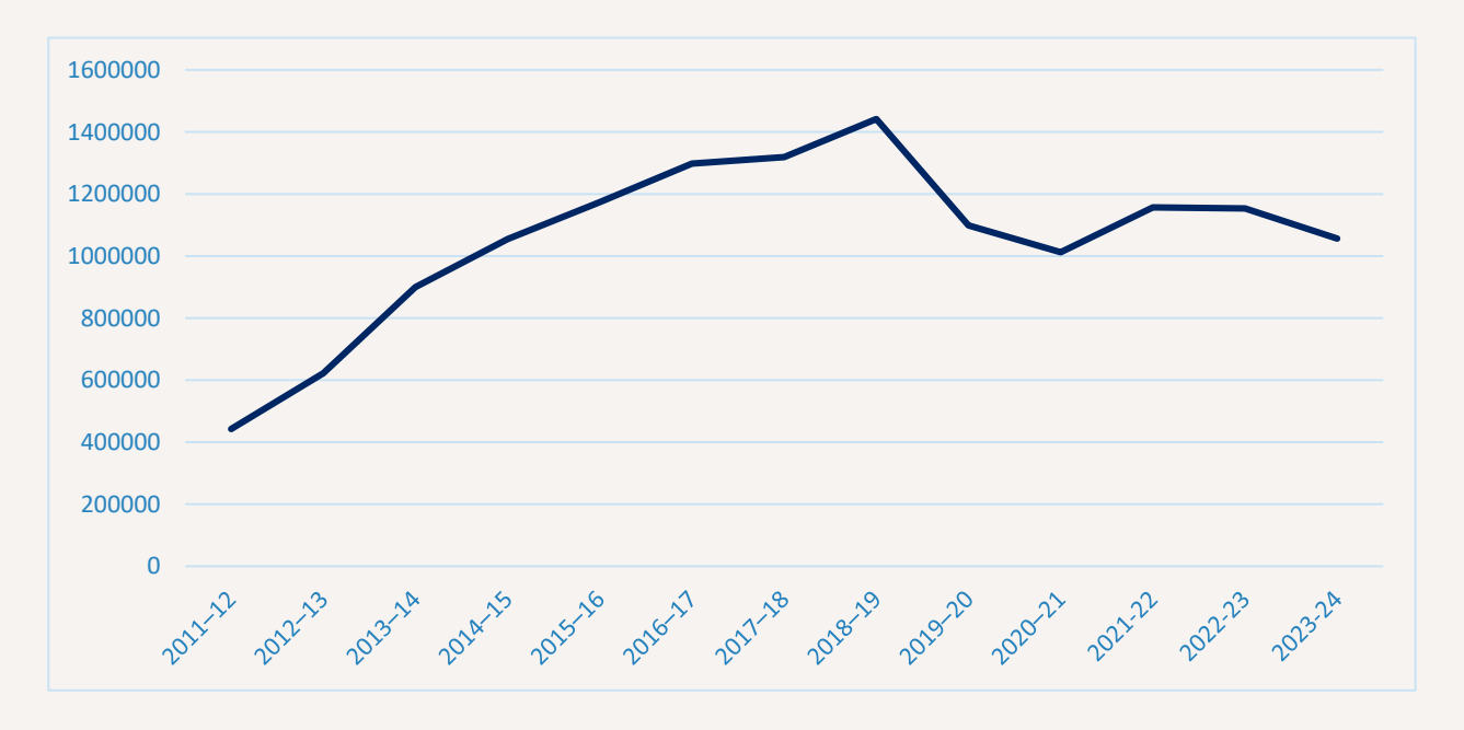
Figure 3: privatehealth.gov.au visitors per year

During 2023-24, visits to the website saw a slight decrease compared to the previous year, with 1,056,477 visitors compared to 1,153,195 visitors in 2022-23. The website largely relies on organic growth, with most visitors discovering the website through search engines.