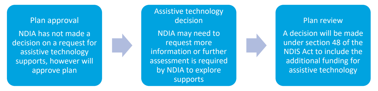
Figure 2— Assistive technology decision-making after plan approval

2.13. In these cases, the NDIA will still approve a plan for the participant, so they can start to access other supports while waiting for the assistive technology requests to be decided. Then, once additional information is provided about the assistive technology request, the NDIA will decide whether to change the plan to include funding for the additional supports. However, as the plan has already been approved, a plan review under s 48 of the NDIS Act is required to include additional funding for approved assistive technology supports.