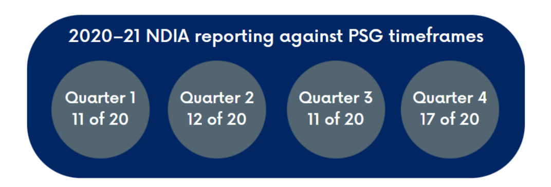
Figure 2: NDIA performance reporting on PSG timeframes 2020-21